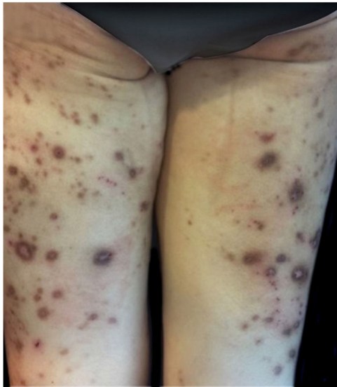
Figure 1 Clinical presentation of a 65-year-old female with generalized umbilicated, hyperpigmented, and excoriated papules and nodules.