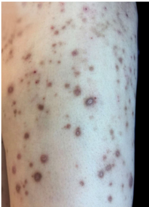
Figure 2 On magnification, a central keratotic plug is visible.

Skin biopsy showed a cup-shaped depression of the epidermis, with an overlying keratin plug containing collagen fibers, keratinous debris, and inflammatory cells on H&E stained sections. Van Gieson staining demonstrated vertically oriented collagen fibers extruding through the epidermis (Figs. 3 and 4).