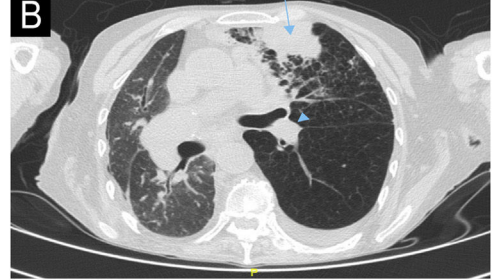
Figure 1 Patient Number 1. In Patient 1, a cutaneous squamous cell carcinoma (cSCC) measuring 1.3 \times 1 cm is observed on the lower lip (A). The axial computed tomography (CT) scan (B) reveals a mass consistent with pulmonary metastasis in the anterior segment of the upper left lobe (blue arrow), along with an associated left paratracheal metastasis (blue arrowheads).