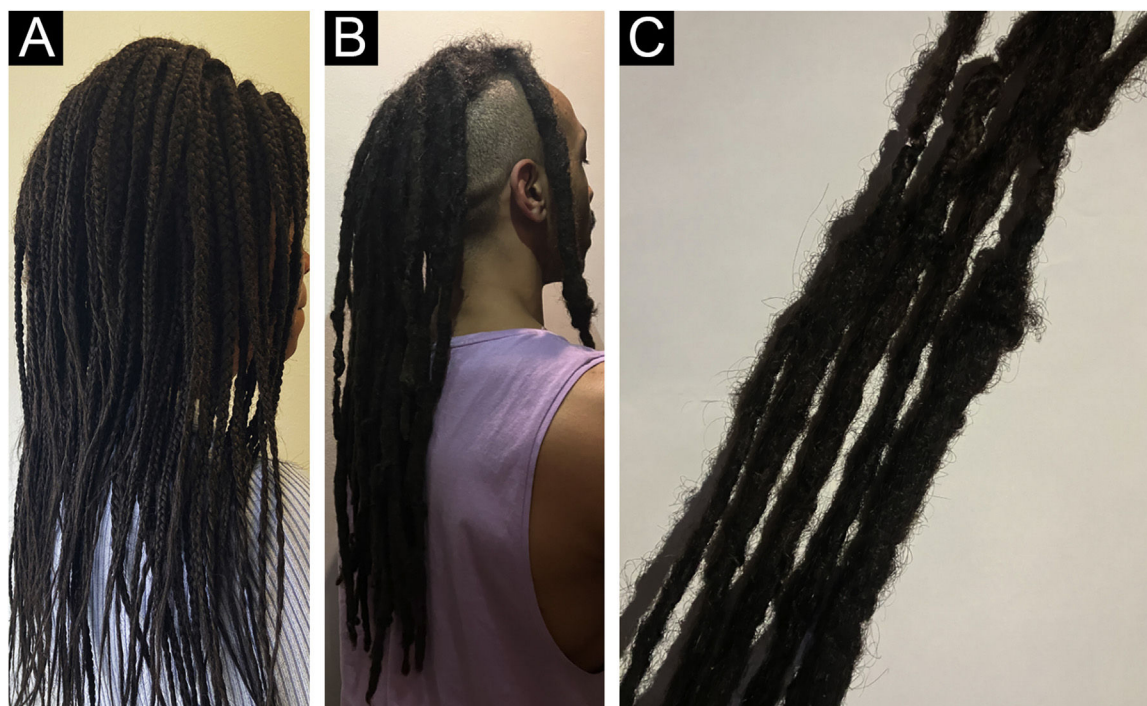
Fig. 2 A case of traction alopecia due to a tight hairstyle, pre (A) and post (B) hair transplant.

as strands may become tangled and knotted, resulting in breakage when attempting to detangle the teased hair. In addition, this technique can lift the cuticle layer, exposing the cortex and making the hair shaft more prone to damage. Furthermore, the significant force and manipulation involved in backcombing can ultimately lead to TA. Finally, when combined with hairsprays or heat styling tools, backcombing can cause hair weathering if not done with care. 7,8,43,60,61 There is a condition, known as bubble hair deformity, characterized by the formation of air cavities within the hair cortex, primarily affecting females, that may be related to backcombing as well as any hairstyle involving heat styling tools. It is typically associated with the prolonged exposure of damp hair to high temperatures generated by blow dryers or styling devices. The high temperature causes hydrolysis of keratin within the hair shaft, leading to local air expansion and the formation of bubbles. While most reported cases of bubble hair deformity involve Caucasian patients, it has been suggested that there may be ethnic differences in susceptibility to this condition: for example, Asian hair has been shown to exhibit significantly more heat-induced protein loss compared to Caucasian hair, potentially due to structural differences in the hair cortex. 62