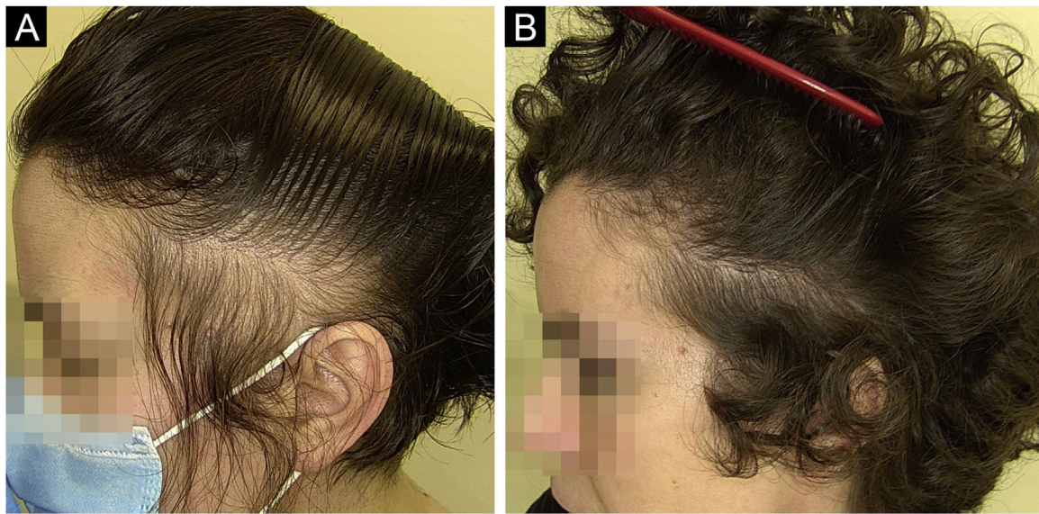
Fig. 3 Different types of dreadlocks (A–B). A close-up image (C) that shows how uncombed hair is twisted to form such clusters referred to as “locks”.