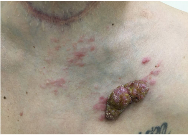
Figure 4 Tumor lesion with papules and satellite erythema on the anterior thorax in a patient with cutaneous metastasis of thyroid cancer. Note the previous thyroidectomy scar