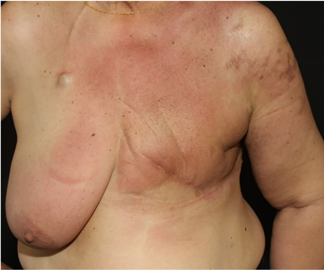
Figure 2 Erythematous infiltrated plaque on the chest of a patient with cutaneous metastasis of breast cancer

occurs predominantly via blood vessels, whereas in erysipeloid carcinoma the spread is lymphatic. 27 In carcinoma en cuirasse , the skin acquires an infiltrated hardened appearance, similar to scleroderma. Finally, in neoplastic alopecia, there are nodules or hardened plaques on the scalp, which result in alopecia. 26 The alopecia can be cicatricial and irreversible, as neoplastic cells can destroy hair follicles and induce fibroplasia. 28 As with melanoma, cases with papules arranged in a zosteriform pattern have also been described. 26 It is noteworthy that presentations similar to telangiectatic, en cuirasse , erysipeloid carcinoma, and mucinous alopecia have been described in metastases from other tumors, but are more commonly secondary to breast adenocarcinoma. 21