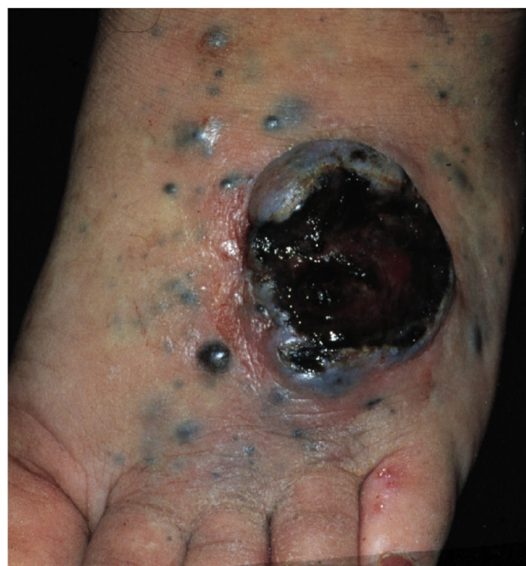
Figure 1 Patient with cutaneous metastases of melanoma with an ulcerated tumor lesion and several papules and satellite nodules on the foot

Cutaneous metastases from melanoma are most commonly found on the back in men and on the lower limbs in women. The fact that secondary cutaneous locations occur