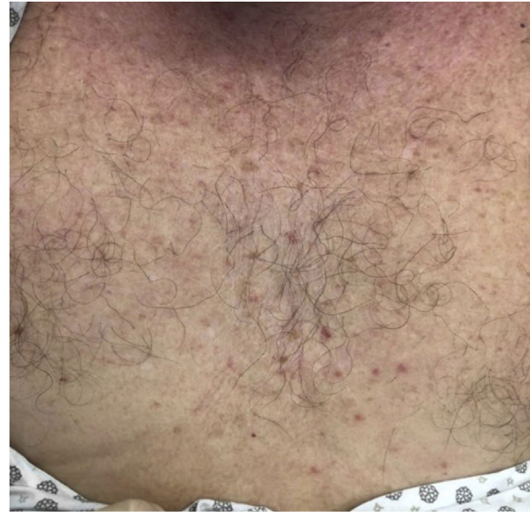
Figure 1 Erythematous rash containing macules and papules.

The authors collected 50 cases of new-onset dermatologic symptoms in patients with laboratory-confirmed COVID-19 treated at Sírio-Libanês Hospital from February to June 2020. The main demographic and clinical findings are summarized in Table 1. The age of the patients ranged between 18 to 99 years, with a mean of 57 years (SD = 18.6 years), and 54% were male. Most patients (74%) had some type of comorbidity and 76% were hospitalized for a mean period of 17.7 days, ranging from 0 to 120 days. Among patients with a