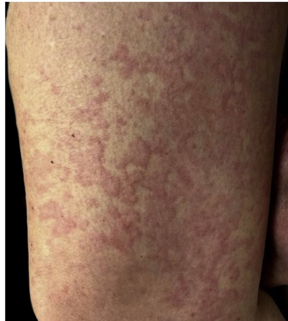
Figure 2 Urticarial rash.

more severe disease, 46% required non-invasive ventilation, 32% were under invasive ventilation, 8% were submitted to dialysis, 4% needed ECMO and only one patient died.