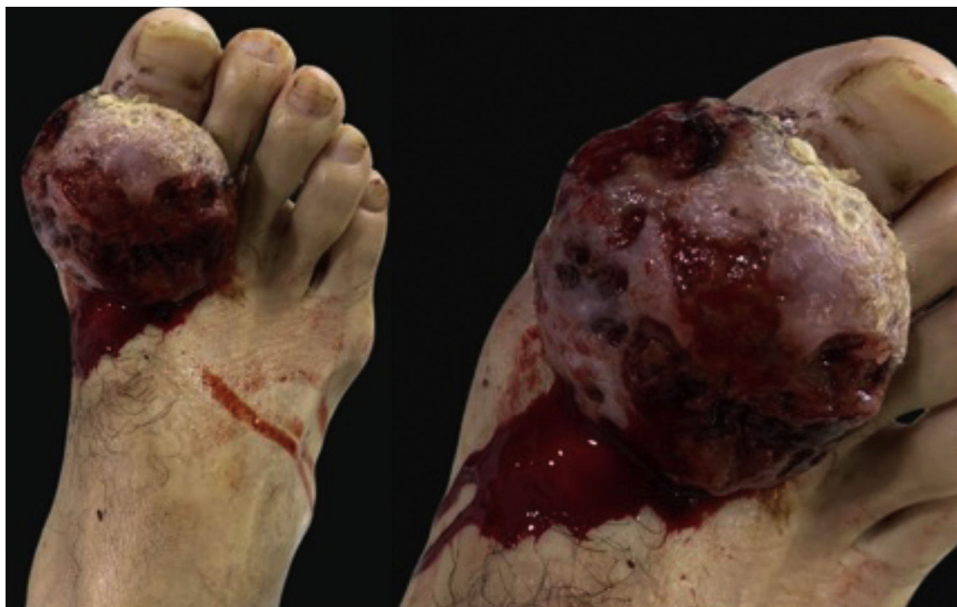
Figure 1 On the right great toe finger exophytic, ulcerated tumor.

The cutaneous presentation represents 75% of the reported cases, the remaining 25% correspond to the visceral type. Botryomycosis can occur at any age, although it rarely occurs in ‘children’s and adults over 70-years old, it mainly involves areas with greater susceptibility to trauma such as hands, feet, head and neck. 1,3,4