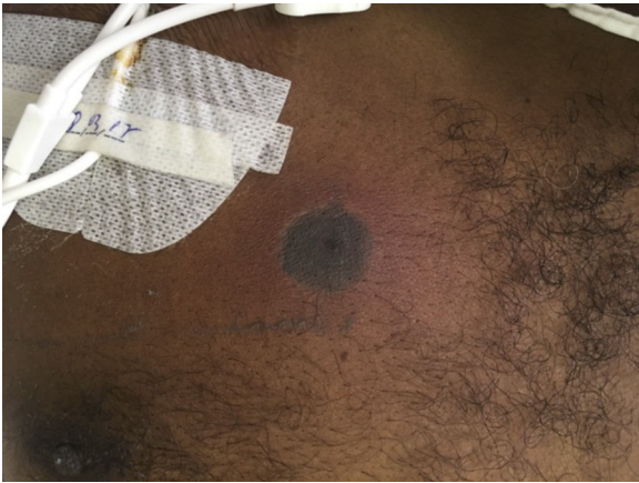
Figure 2 Single erythematous lesion with necrotic center in the anterior thoracic region, close to the Hickman catheter.