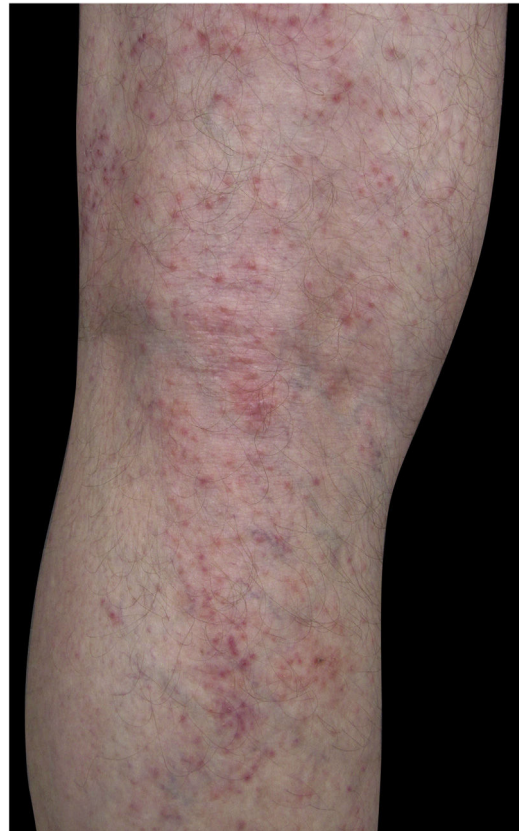
Figure 1 Eczema on the lower limb due to allergic contact dermatitis to corticosteroid.

Four (66.7%) of the six cases had lesions in the lower limbs, two (33.3%) in the upper limbs, one (16.7%) in