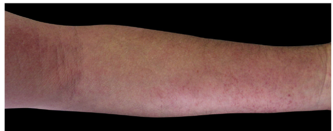
Figure 2 Eczema on the upper limb due to allergic contact dermatitis to corticosteroid.

the trunk, and two (33.7%) had a disseminated pattern (Figs. 1 and 2). The typical picture, as in the present cases, is a dermatosis that is refractory to treatment with corticosteroids, characterized by eczematous lesions, which may be more evident on the edges than in the center. More-