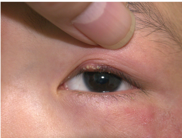
Figure 1 Clinical presentation: erythema with mildly scales on the periocular skin and sesame-sized milky papulopustules on the left upper palpebra.

A 10-year-old boy was referred to our clinic with symptoms consisting of two-week-old itchy erythema on periocular skin and multiple 3-day-old papulopustules on the left upper palpebra. The patient had animal contact about one month ago and the lesions were not treated previously. Physical examination revealed erythema with mild scales on the periocular skin and several sesame-sized milky papulopustules on his left upper palpebra (Fig. 1). Routine laboratory findings including blood and urine, hepatorenal function and immunity items were normal. Because the subject had contact with his dog, a mycological examination was performed. Multiple fungal hyphae and white fuzzy-