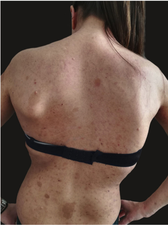
Figure 1 Clinical signs of type 1 neurofibromatosis and atopic dermatitis. Eczematous lesions, with erythema, oozing and crusting, several cafe au lait spots, freckles, cutaneous neurofibromas.