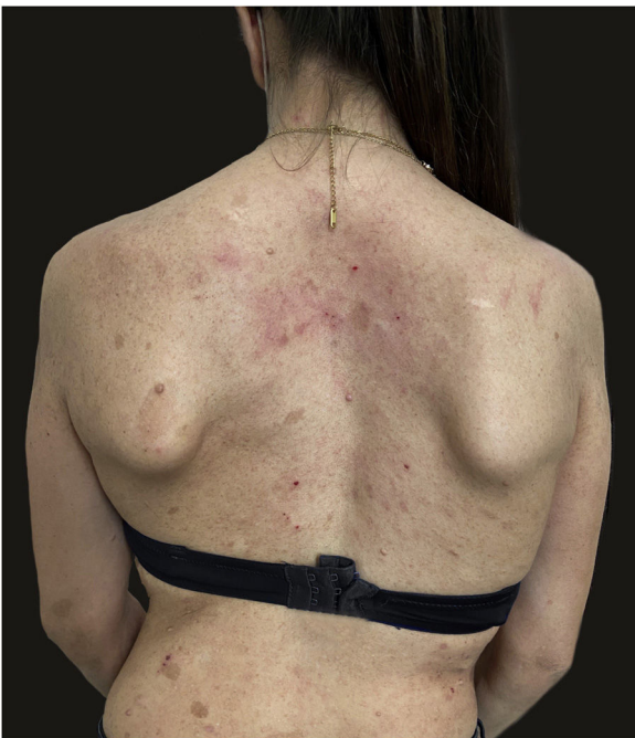
Figure 2 Remission of atopic dermatitis after 4 weeks of treatment with dupilumab. Residual eczematous lesions, as seen on the neck, determined an EASI score of 4.