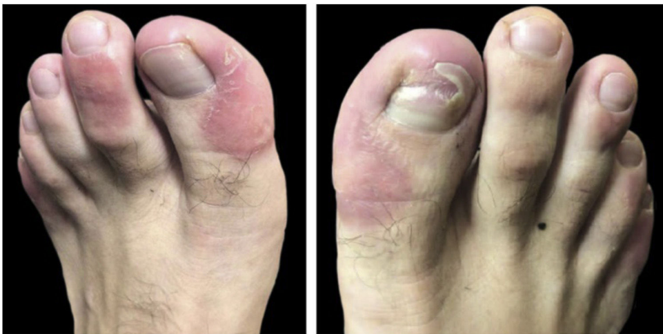
Figure 2 Erythematous scaling plaques on toes and onychodystrophy on the right hallux.