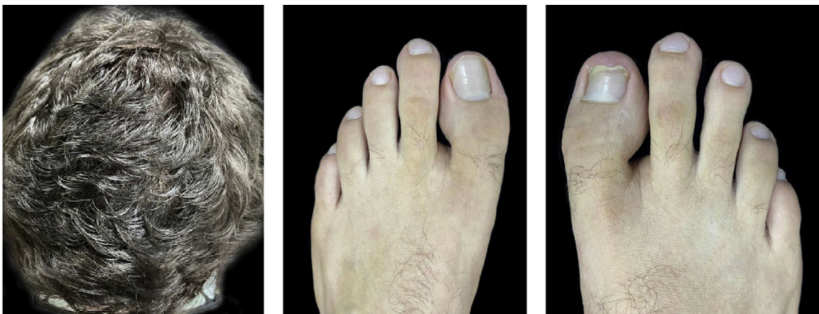
Figure 3 Ten months after the onset of the condition, with complete hair regrowth and remission of erythematous-scaling lesions on toes and onychodystrophy undergoing resolution on the right hallux.