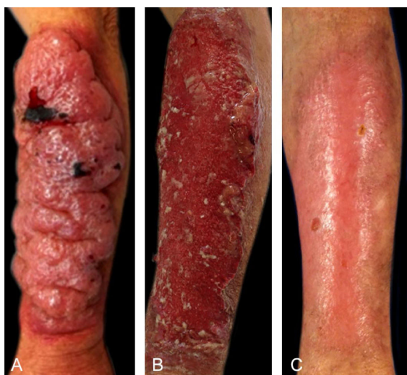
Figure 1 (A) Friable tumor with a mucoïd aspect; (B) Post-detachment of the mucoïd and necrotic plaque; (C) Healing at 120 days.

tion is polymorphic (papules, purpura, vesicles/blisters, pustules, nodules, tumors, ulcerations, necrotizing panniculitis/cellulite, abscesses, acne-like lesions and molluscum contagiosum-like lesions), and can delay the diagnosis and lead to unfavorable outcomes. 1-7