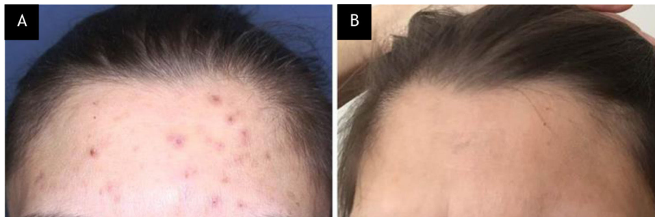
Figure 2 Case 2, (A), Erythematous and excoriated papules, and hyperpigmented macules on the forehead of the patient with acne excoriée. (B), Complete clinical improvement after 6-weeks on N-acetylcysteine treatment.

the article and revising it critically for important intellectual content; final approval of the version to be submitted.