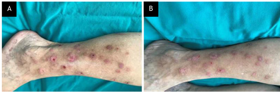
Figure 1 Case 1, (A), Multiple irregularly shaped erythematous or hyperpigmented, eroded, excoriated, or lichenified papules and nodules of varying size on the right leg of the patient with neurotic excoriation. (B), Partial clinical improvement after 2-weeks on N-acetylcysteine treatment.