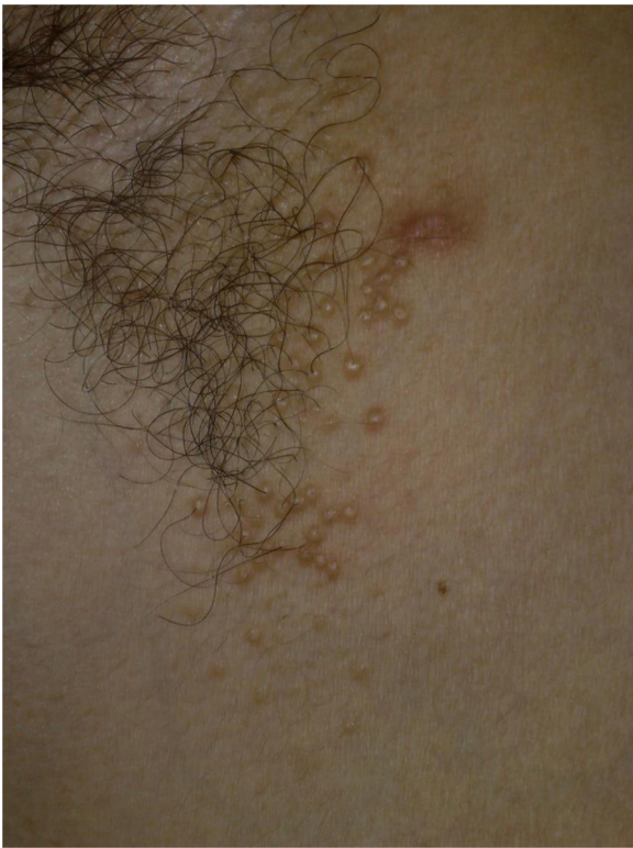
Figure 1 Right axilla presenting discrete and grouped skin-colored, shiny, firm, monomorphic round, and dome-topped papules of 1-to 3-mm.