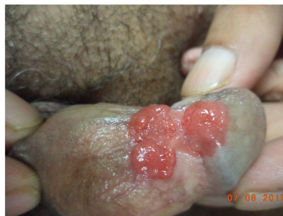
Figure 1 Well defined, erythematous, fleshy, lobulated, sessile growth involving glans, coronal sulcus and shaft of penis.

The asymptomatic beefy red lobulated plaque on the penile region has various differentials. As the patient had a negative tissue smear, the possibility of Condyloma