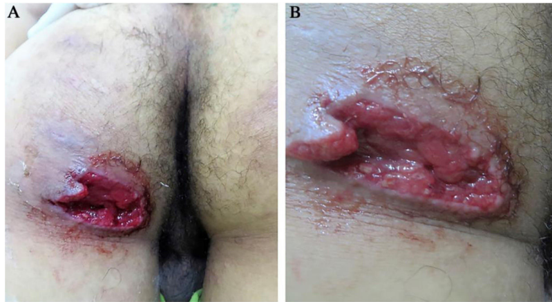
Figure 1 (A and B). Deep ulcer with irregular, well-defined borders, piercing, mild perilesional erythema, clean fundus, granular, without exudation on the left gluteus.