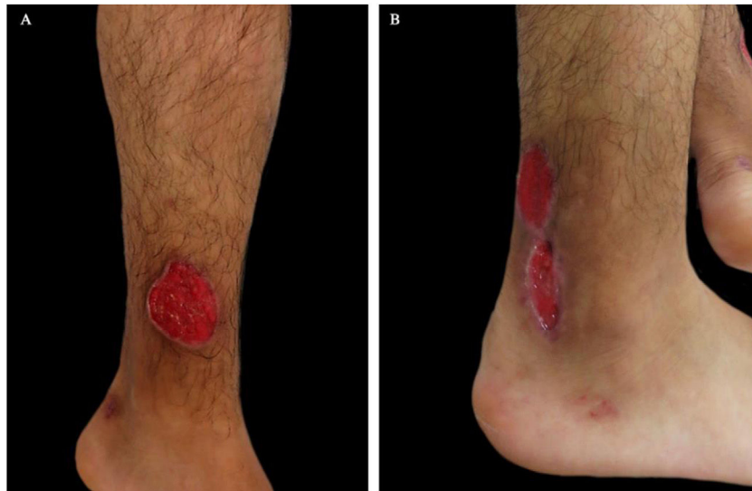
Figure 4 (A and B). Superficial ulcers, round in shape, well-defined, raised and slightly violet borders on both legs.