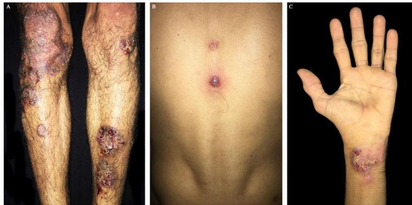
Figure 2 (A and C). Erythematous nodules ulcers with violet brownish, well-defined, slightly raised borders, cribriform in the middle on legs and hands. (B) Violet papule with central vesiculation on the back dorsum.