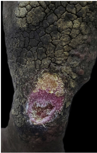
Figure 2 Left leg ulcer before treatment.