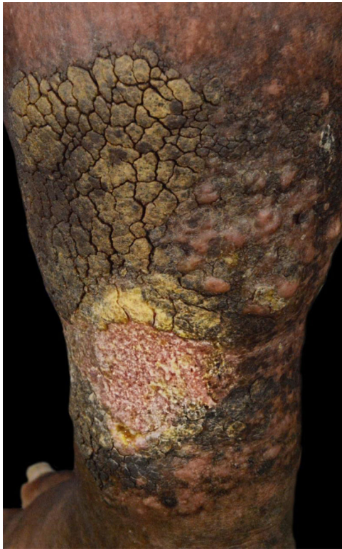
Figure 3 Complete healing of the left leg ulcer after two months of treatment.

Treatment was initiated with the use of a vitamin B complex and oral folic acid, in addition to maintaining daily dressings.