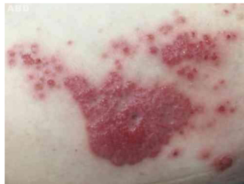
Fig. 1 Vegetating plaque and erythematous and pinkish papules grouped in the lateral region of the right thigh.

Histopathology assessment is necessary for diagnostic confirmation, the eccrine ducts may or may not be demonstrated. Immunohistochemistry can help in difficult cases, with cells often positive for keratin 6 and 19, as well as filaggrin. 2