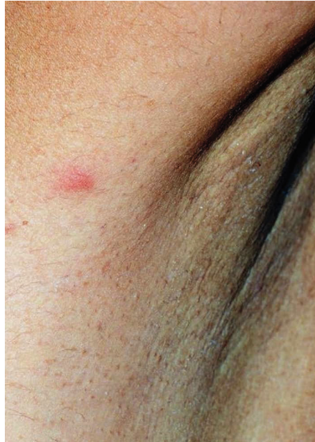
FIGURE 3: Erythematous papule on the right axilla of one of the adult women