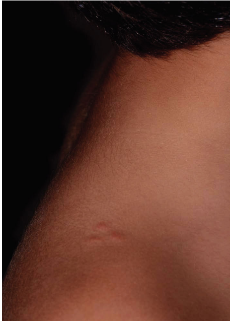
FIGURE 1: Erythematous papules on the right shoulder of a 10-year-old child