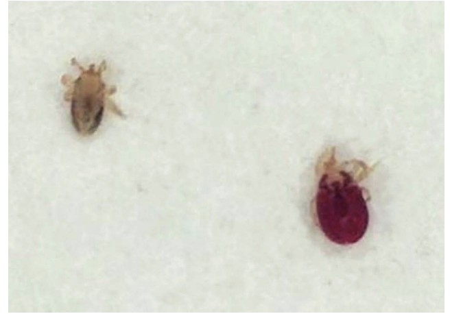
FIGURE 6: Adult pigeon lice: three pairs of legs and flat body (X10 magnification)

sheets and clothes in the bedrooms, besides a thorough cleaning of the air-conditioner and fumigation of the residence and the area where the pigeon nest was removed from. As repellent, inert polymer gel was used over the air-conditioner where the birds used to land, which was very effective in preventing the return of the birds. Even using the topical medication as prescribed, it took two weeks for the complete resolution of the lesions.