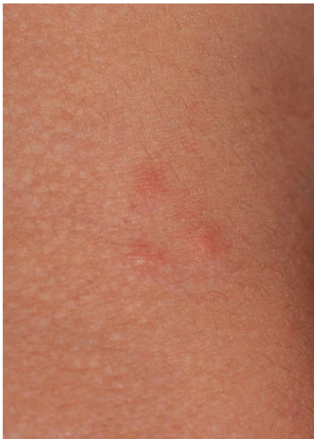
FIGURE 2: Close-up view: grouped erythematous papules on the right shoulder of the index patient