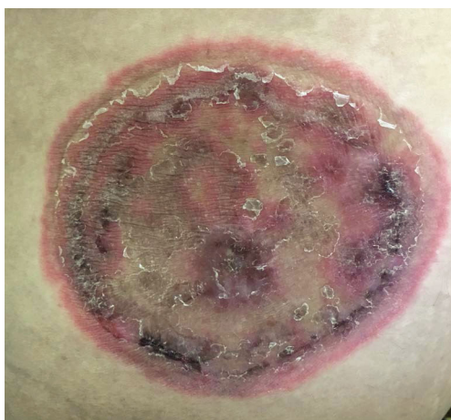
FIGURE 1: Round plaque with well-defined borders and figurate center

The dermatophytes comprise 3 genera of fungi capable of invading keratinized tissues: Trichophyton , Microsporium , Epidermo-