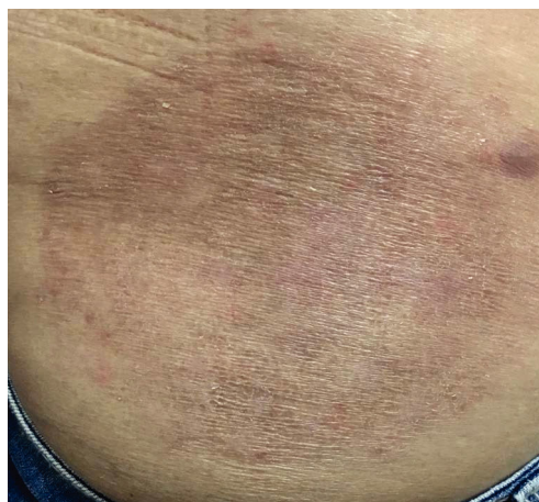
FIGURE 4: Lesion after treatment

phyton . Non-specific, cellular and humoral immunologic responses act in an attempt to block infection in the host. 1