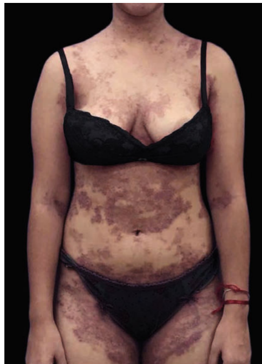
FIGURE 4: After treatment (30 days): hyperchromic macules in the regions of previous pustular lesions