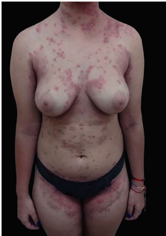
FIGURE 1: Before treatment: pustular eruption distributed throughout the trunk and flexor aspects of the limbs mingled with hyperchromic macules

reports of pediatric SPD have indicated that the clinical condition is similar both in children and adults. In 2013, Scalvenzi et al. reported a case of a 7-year-old patient with an erythematous-base pustular