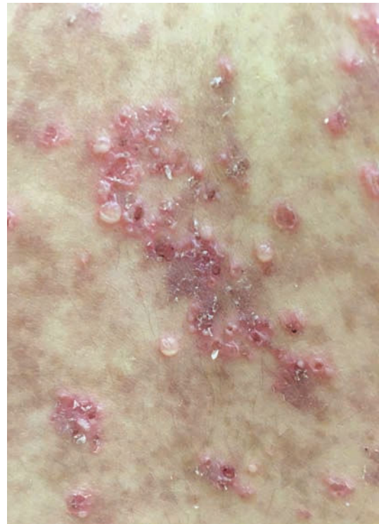
FIGURE 2: The "half-and-half" aspect of pustules with a serpiginous aspect, erythematous base and crusts