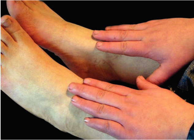
FIGURE 4: Acrocyanosis on both hands with slight livedo reticularis in the dorsal aspect. Feet are not compromised