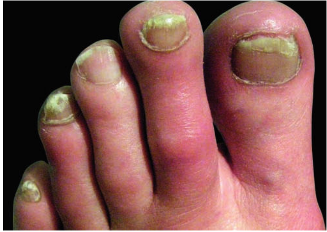
FIGURE 3: Combined erythema and edema due to foot erythromelalgia

Small fiber neuropathy is considered as an early disorder in painful diabetic neuropathy that contributes to the presence of distal ulcers. Moreover, it might be an interaction between the latter neuropathy and the microcirculation in these patients. The diabetic microangiopathy and neuropathy could add up to the EM with an overlapping of signs and symptoms generating difficulties in the