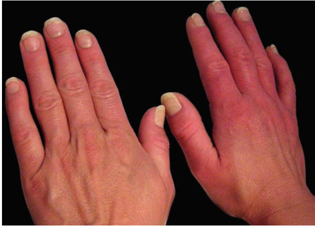
FIGURE 2: Erythema and edema on both hands, more pronounced on the right

ary infection followed by fissures, blisters, painful ulcers, cyanosis, gangrene or necrosis. Many patients know that burning pain is relieved with cold water or ice, an electric fan or staying in places with low temperature. Some of these methods lead to skin maceration followed by epidermis slough thus increasing the damage to the skin barrier. Cold could trigger long lasting vasoconstriction provoking ischemia and tissue necrosis, what could be interpreted by patients as aggravation of the disorder. Cutaneous dystrophies could increase pain and at the same time slow skin repair, deteriorating their quality of life and leading to social isolation, and in case of hypothermia adding a life-threatening risk. The patient must be advised to discontinue these practices. Some patients could develop skin automutilation behavior; although its mechanism is unknown, the poor quality of life could be related to this condition. 2,18,32,34,36,62,66