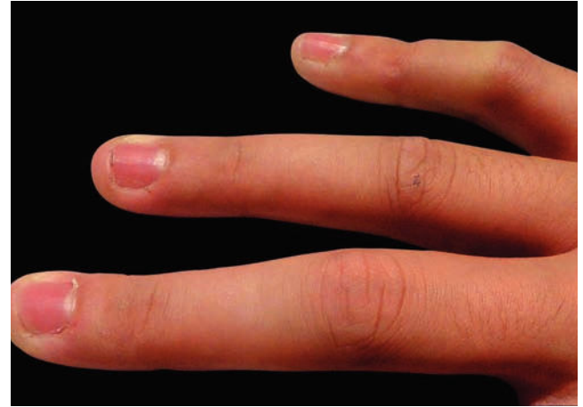
FIGURE 5: Red nails on hand