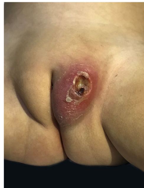
Figure 2 Skin ulcer in labia majora, seven days of evolution.