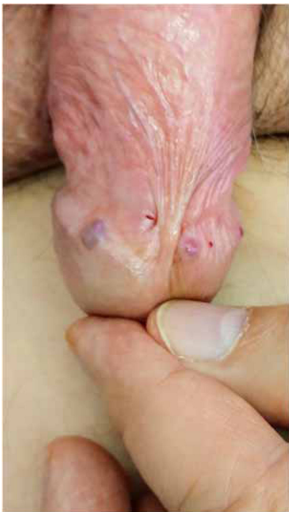
Figure 1 Erythematoviolaceous papules on the corona of the glans.

vessels, hemorrhage, frequent mitoses, and few cellular atypias (Fig. 3).