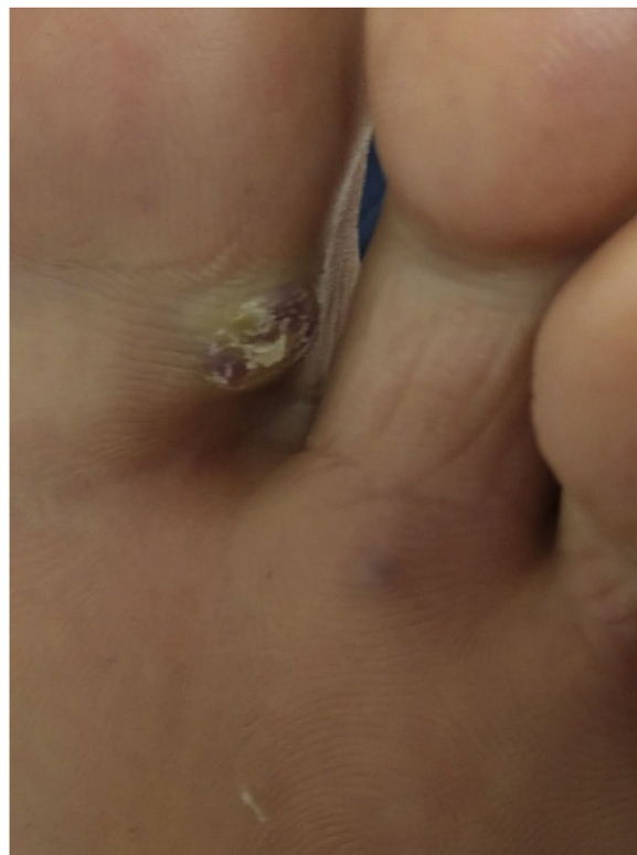
Figure 2 Violaceous papule with slightly verrucous surface in the interdigital space of the foot.

In greater detail, gaps with extravasated erythrocytes, few atypical cells, and several mitoses can be observed (Fig. 3). The immunohistochemical study detected nuclear positivity for antibodies against the Kaposi's sarcoma-associated herpesvirus (Fig. 3, inset). Contrary to clinical expectations, fourth-generation ELISA tests, performed at a two-month interval, were negative on both occasions. To better discard HIV infection, viral load was measured by a PCR test, which was also negative. Serology for hepatitis B and C was negative; FTA-Abs was positive and VDRL was non-reactive. Computed tomography of chest and abdomen did not show any lesions. Cryotherapy sessions were unsuccessful.