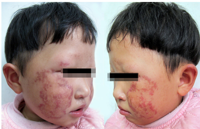
Figure 1 Poikiloderma in a patient with RTS. Depigmentation, hyperpigmentation, punctate atrophy, telangiectasia, and loss of eyebrows are seen bilaterally on the face.