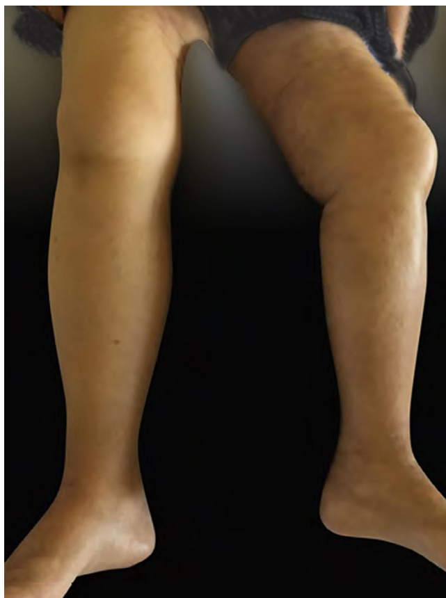
Figure 1 Cutaneous infiltration of the lower limbs, more extensive on the left side, and on the right side affecting the root of the thigh.