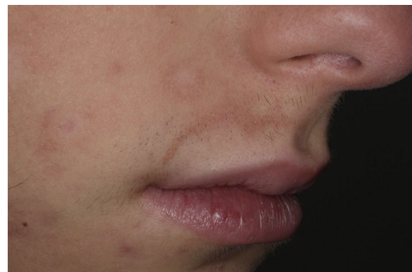
Figure 1 Achromic spots surrounded by halo erythematous and polios is in beard hairs in the malar and right perioral regions.

Although the cause-effect relationship of this association has not yet been proven, the increasing appearance of new cases in the literature is a warning sign for dermatologists to keep vigil on this possible new side effect.