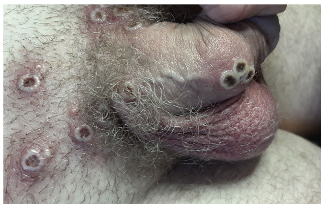
Figure 1 Multiple crusted lesions in the genital region.

examination revealed no other skin/mucous lesions. The patient was otherwise healthy. Serological tests for syphilis (Venereal Disease Research Laboratory – VDRL and Treponema Pallidum Hemagglutination Assay – TPHA) and HIV were negative. He was treated with a single oral dose of azithromycin 1 gram and the next day the fever disappeared. By the fourth day, lesions had a central crust (Fig. 1) and were still painful. Since sexually transmitted diseases had been excluded and monkeypox was suspected the patient was referred to the Clinic for Infectious Diseases where skin lesions swabs were collected, and a real-time polymerase chain reaction detected monkeypox virus. He was treated with symptomatic therapy and hospitalized for five days. After that, he was isolated at home. All skin lesions regressed completely within 5 weeks.