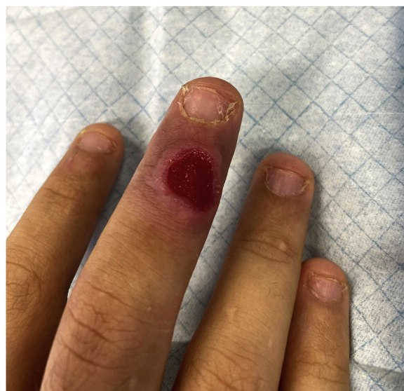
Figure 1 Ulcer on the third finger of the right hand.

Extragenital primary syphilis is a rare event, corresponding to 2%–7% of reported cases, 3 with the oral cavity being the most frequently affected area. 2,4 The natural history, treatment, and prognosis of primary lesions do not depend on their location.