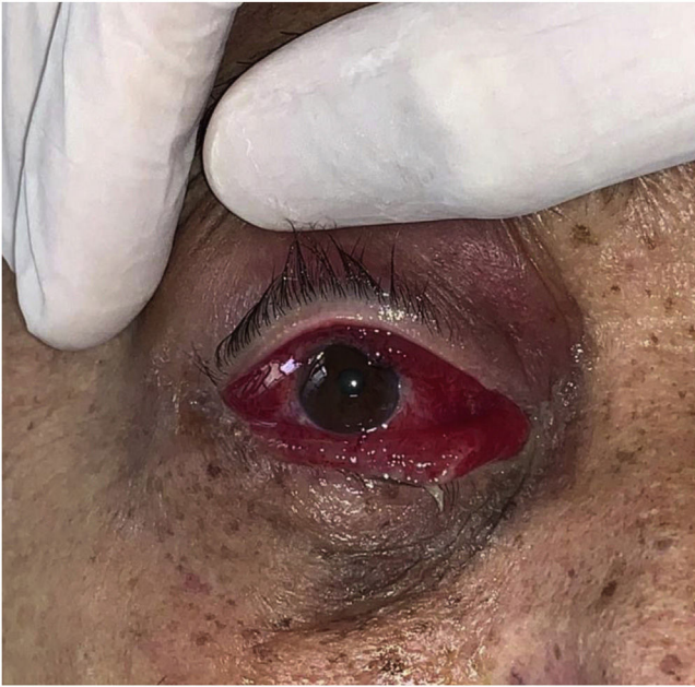
Figure 1 Erythema and severe swelling of the conjunctiva associated with upper eyelid erythema. Rhino-orbito-cerebral mucormycosis.

apy, and respiratory physical therapy. He was discharged from this hospital and immediately sought the service with edema and intense erythema on the right conjunctiva, mild erythema on the upper eyelid (Fig. 1), and ocular plegia on dynamic examination. Complementary tests showed DM decompensation, and a computed tomography showed inflammatory sinus disease. With the diagnostic hypothesis of rhino-orbito-cerebral mucormycosis, a surgical approach was performed, and the material was sent for histological examination, which showed coenocytic hyaline hyphae with a 90° angle (Fig. 2), and for fungal culture, which