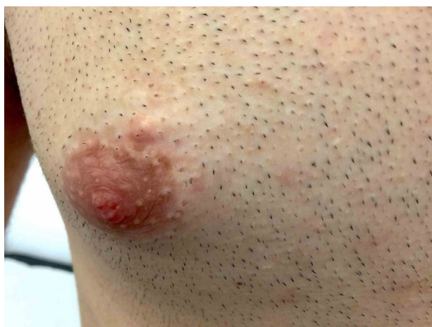
Figure 1 Velvety, soft, and pink papule located on the right periareolar region, corresponding to a superficial cutaneous myxoma.

ferential diagnosis of these tumors with other dermic and hypodermic lesions. In this case report, the authors describe for the first time the ultrasonographic features of both superficial and subcutaneous myxomas in a patient with CNC.