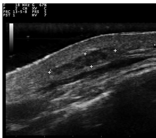
Figure 2 Transverse sonogram (18MHz) of the subcutaneous myxoma, showing an ill-defined, elongated, heterogeneous, and hypoechoic mass located in the deep dermis and hypodermis.

With the diagnosis of CNC, the following tests were performed: echocardiogram, thyroid and testicular US, 24-h urinary free cortisol, plasma insulin-like growth factor-1, and PRKAR1A sequencing. No alterations were found except for the presence of thyroid colloid nodules and the p.Val164GlufsX5 mutation in the PRKAR1A gene, which was present in the patient but not in his first-grade relatives.