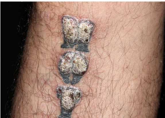
Figure 4 Closer view of the verrucous lesions - note that areas tattooed in black are spared.