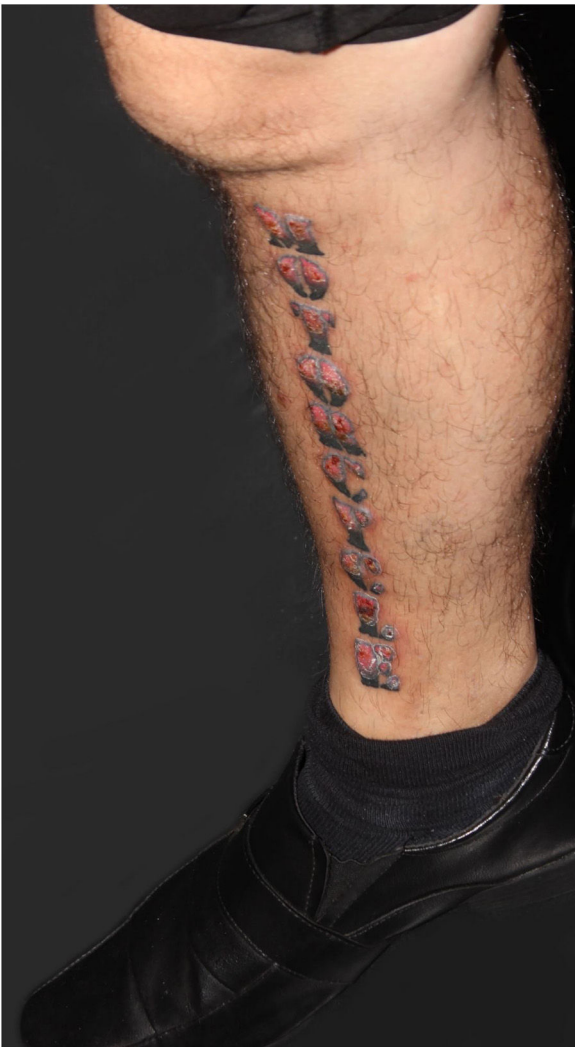
Figure 1 Clinical aspect of the tattoo approximately two months after the procedure: infiltration and inflammation of the red pigment area.

vacuolar degeneration of the basal layer. There was a nodular, diffuse and lichenoid infiltrate in the dermis, consisting predominantly of lymphocytes and histiocytes containing variable amounts of pigment. Marked inflammatory infiltrate aggression to the follicular epithelium was observed (Fig. 5). Special stains for microorganisms and tissue cultures for fungi and mycobacteria were negative. Immunohistochemistry showed: CD3 positivity in rare epidermal lymphocytes; CD4 and CD8 positivity in rare cells; CD4:CD8 ratio of 2:1; CD56 positivity in numerous mononuclear cells in the dermis. The final diagnosis of a lichenoid reaction to the tattoo red pigment was attained. Despite the lack of clinical response to the performed therapies (local infiltration of corticosteroids, and excision by shaving the verrucous lesions), the patient stated that he would certainly tattoo his skin again.