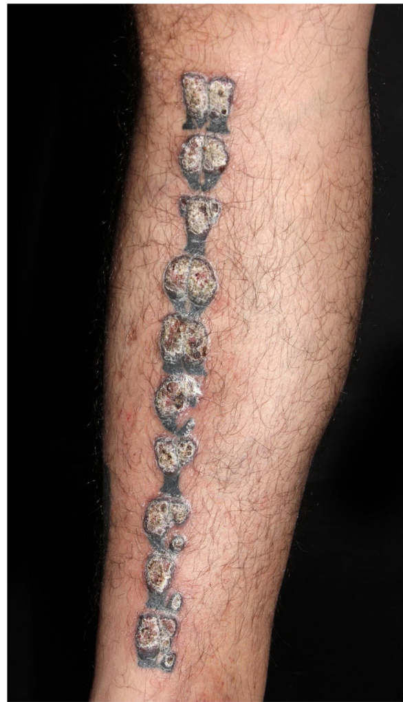
Figure 2 Clinical aspect after a few weeks: verrucous appearance of the regions tattooed with red pigment.

vacuolar degeneration of the basal layer. There was a nodular, diffuse and lichenoid infiltrate in the dermis, consisting predominantly of lymphocytes and histiocytes containing variable amounts of pigment. Marked inflammatory infiltrate aggression to the follicular epithelium was observed (Fig. 5). Special stains for microorganisms and tissue cultures for fungi and mycobacteria were negative. Immunohistochemistry showed: CD3 positivity in rare epidermal lymphocytes; CD4 and CD8 positivity in rare cells; CD4:CD8 ratio of 2:1; CD56 positivity in numerous mononuclear cells in the dermis. The final diagnosis of a lichenoid reaction to the tattoo red pigment was attained. Despite the lack of clinical response to the performed therapies (local infiltration of corticosteroids, and excision by shaving the verrucous lesions), the patient stated that he would certainly tattoo his skin again.