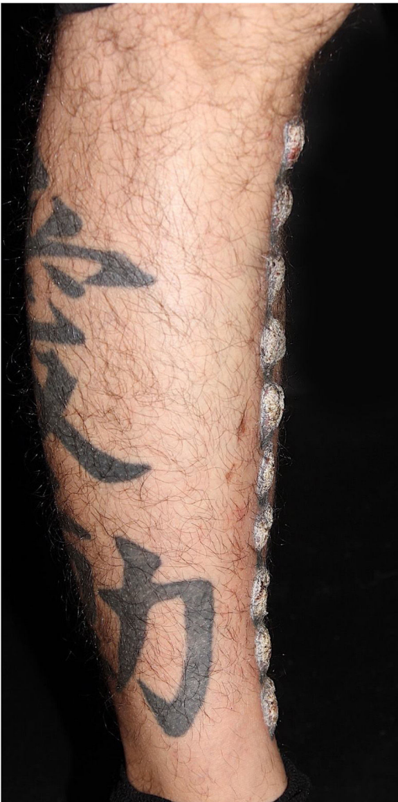
Figure 3 Lateral view of the verrucous lesions; notice a black tattoo with normal aspect on the lower leg.