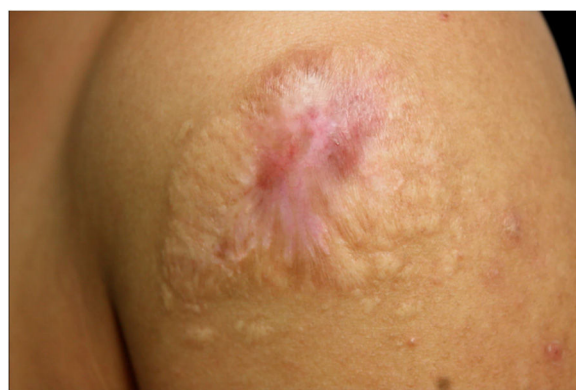
Figure 4 Lesion completely healed after 20 months of evolution and two months of treatment with saturated solution of potassium iodide.

The antifungal sensitivity profile of the clinical isolate molecularly identified as S. brasiliensis , performed using the CLSI M38-A2 method, showed the following minimum inhibitory concentrations (MIC): amphotericin B, 2.0 µg/mL; itraconazole, 1.0 µg/mL; terbinafine, 0.125 µg/mL. The