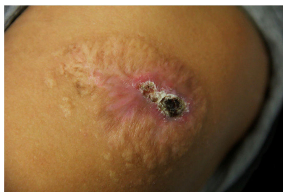
Figure 3 Infiltrated plaque with central sero-hematic crust after 18 months of treatment. Eleven months with itraconazole followed by seven months of terbinafine, combined with 11 sessions of cryosurgery at monthly intervals.

of biofilm in the yeast and filamentous phases. 4,5 It is also an alternative in cats refractory to itraconazole. 6