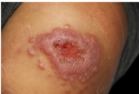
Figure 1 Infiltrated plaque with central ulceration surrounded by multiple satellite papules of 75 days evolution.