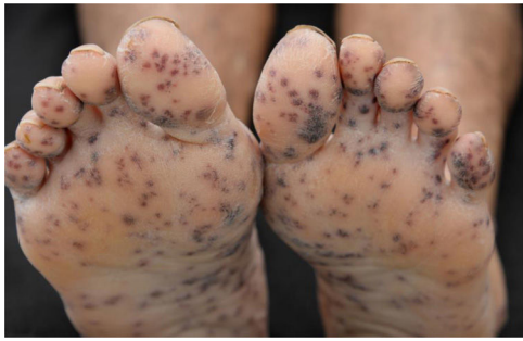
Figure 1 Multiple, bilateral palpable petechiae and purpura on the soles.