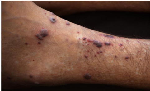
Figure 2 Palpable purpura and necrotic vesicles on the left lower limb.

inflammatory process with central caseation. The bronchoalveolar lavage revealed three alcohol-acid fast bacilli (AAFB).