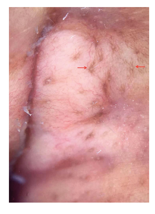
FIGURE 2: Dermoscopy examination of a nodular lesion revealed pigmented stripes radiated from hair follicles (indicated by red arrows) on a pink background, as well as linear branched and reticular vascular patterns