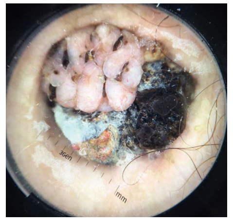
FIGURE 2: Dermoscopy of the cerebriform area shows commashaped and irregular linear vessels on light pink background

Received 06 July 2017. Accepted 07 January 2018.