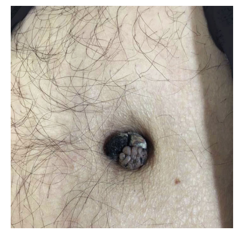
FIGURE 1: Brownish cerebriform umbilical nodule 2cm in diameter with surrounding serous and hematic crust

Sister Mary Joseph's nodule is a metastasis located in the umbilicus, originating from advanced intraabdominal tumors and with a somber prognosis. Clinically, it presents as a firm, painful, irregular nodule 0.5-2cm in diameter. The surface may also present ulceration, necrosis, and purulent or serous secretion. In dermoscopic examination of this nodule, Mun JH et al. described vascular polymorphism with serpentine linear and curved linear vessels with whitish and milky-red unstructured areas. Differential diagnosis should include umbilical hernia, malignant or benign primary tumors on the umbilical region, omphalitis, keloids, pyo-