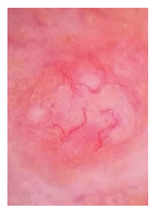
FIGURE 2: Dermoscopy of the lesion shows irregular linear vessels, pseudocysts, and yellowishbrown lumps (globules) surrounded by white halos

trative growth, poorly demarcated, extending deeply to the dermis and subcutaneous tissue. The lesion's surface typically presents a squamoid appearance and ductal differentiation in the deep portion. In 86% of cases there are associated actinic keratoses, similar to the case described here. ^{1,2}