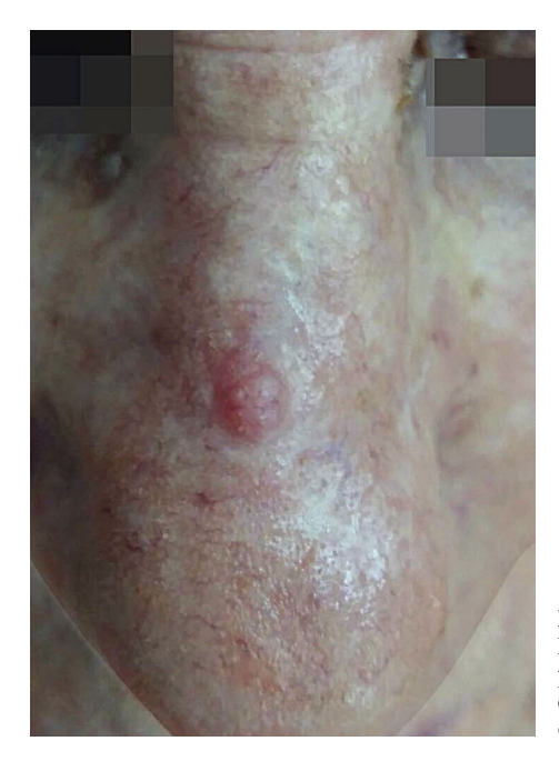
FIGURE 1: Normochromic papule located on the nasal dorsum