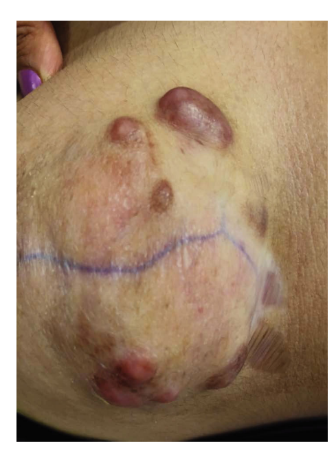
FIGURE 1: Multiple erythematous infiltrated plaques and nodules present on the right breast surrounding an area with atrophy, hypopigmentation and erythema