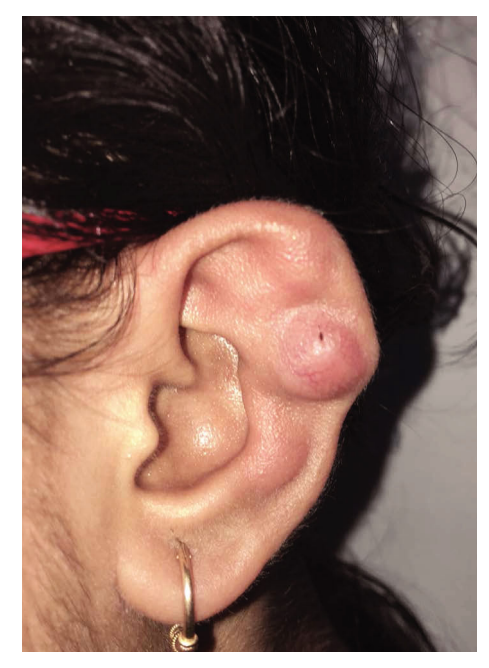
FIGURE 2: Reddish-yellow nodule with telangiectasia present on the pinna of the left ear

RDD, originally known as sinus histiocytosis with massive lymphadenopathy, is a benign histiocytic proliferative disorder characterized clinically by a massive, painless, often bilateral cervical lymphadenopathy accompanied by fever, neutrophilia, anemia, raised erythrocyte sedimentation rate and polyclonal hypergammaglobulinemia.¹ Extranodal involvement is seen in 43% of cases with skin being the most commonly affected site. The term cutaneous Rosai-Dorfman disease (CRDD) is used to describe the rare form of RDD which involves the skin exclusively with no involvement of lymph nodes or other sites.