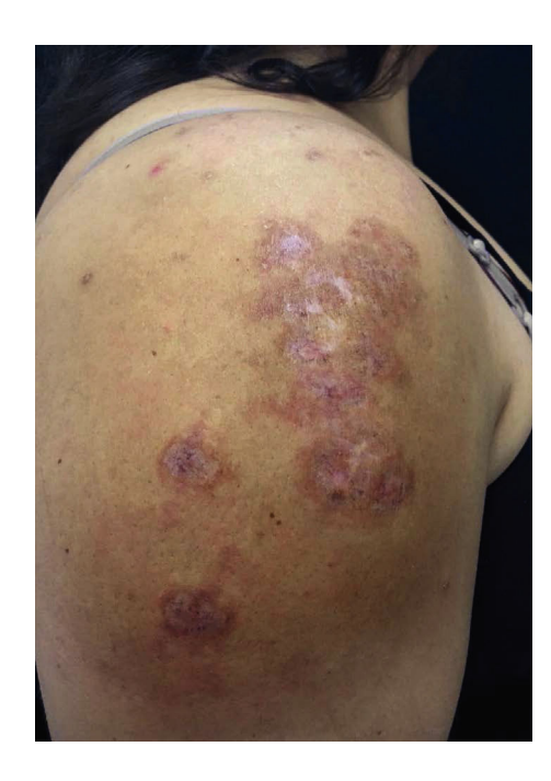
FIGURE 3: Browerythematous, atrophic and residual plaques in the right deltoid region after induction (weeks 0, 2 and 6) and two maintenance doses (weeks 14 and 22) of infliximab

histopathological data, after exclusion of differential diagnoses.<sup>2</sup> Although the cause is yet unknown, <sup>1,2</sup> numerous works have proposed to demonstrate substances that may function as triggering or aggravating factors or may simply be related to its physiopathogeny. It is believed that a certain agent, infectious or not, must act on an immunogenetically predisposed individual.<sup>2</sup> In the formation of sarcoidal granuloma, innumerable cells, interleukins, and intercellular communication pathways are involved. Among them, the lymphocytes T CD4+ are highlighted.<sup>1,2</sup> Interleukin-2, interferon gamma, and tissue necrosis factor-alpha play important roles.<sup>1,2</sup>