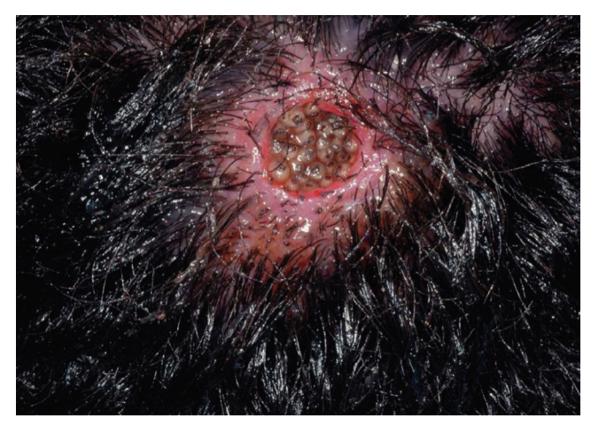
FIGURE 1: Well-circumscribed round ulcer with multiple larvae