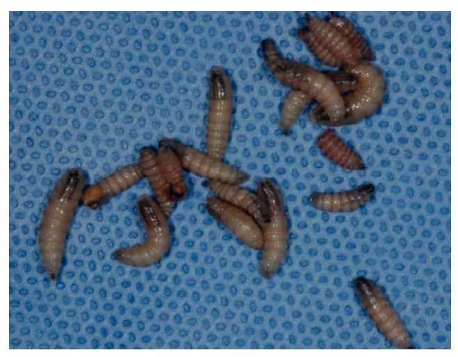
FIGURE 3: Macroscopic appearance of Cochliomyia hominivorax larvae after extraction