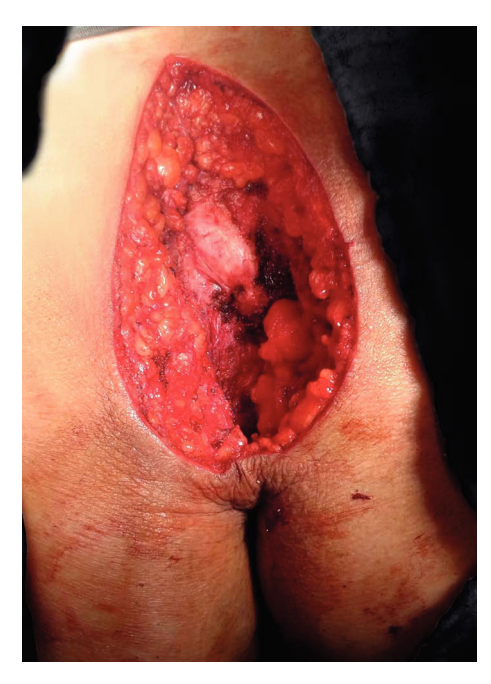
FIGURE 1: Tumor bed after dissection on the prone position and by fusiform excision

The pathology report described a tumoral mass lined by squamous eptithelium with intensive dysplasia, and a contained microscopic tumoral invasion in one site. The tumor consisted of atypical and normal squamous cells and showed keratinization in solid masses and cordons. The tumor invaded subcutaneous adipose tissue and skeletal muscle tissue. The surgical skin excision margins were reported as being clear of tumor, and the squamous cell carcinoma developed from the epithelial lining of the tailgut cyst. The large cyst was multilocular, as well as its related small cysts in the pelvic cavity, and the underlying epithelium was mod-