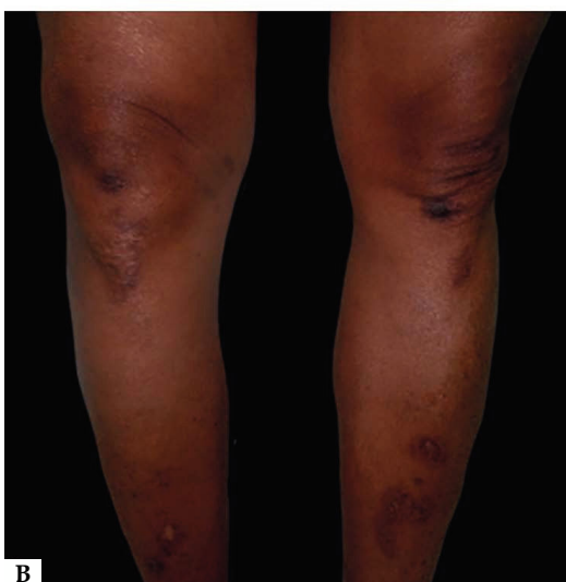
FIGURE 3: After 1 year of treatment with dapsone

matitis herpetiformis, and rheumatoid neutrophilic dermatitis. Older lesions can be mistaken for tuberous xanthoma, granuloma annulare, rheumatoid nodules, and multicentric reticulohistiocytosis. <sup>23</sup>