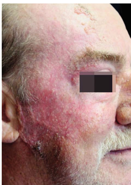
FIGURE 1: Before and after treatment. Left: extensive verrucous plaque in the right temporomalar region, with erythematous and infiltrated borders and scaly, crusted central ulcerations. Right: appearance after the established therapy