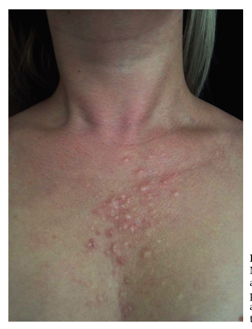
FIGURE 1: Normochromic and confluent papules on the anterior side of the thorax

The disease is characterized by multiple small, circumscribed, uniformly-sized, hypochromic and achromic, non-follicular, oval or rounded papules located predominantly on the torso and upper extremities.<sup>1,2,5</sup> Rarely, there is involvement of the mandibular, occipitocervical and retroauricular regions, face and scalp.<sup>3</sup> The lesions are generally asymptomatic, with a stable evolution over years.<sup>1</sup> No extracutaneous manifestations have been reported.<sup>1</sup>