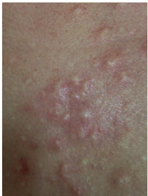
FIGURE 2: Normochromic, confluent papules with erythematous borders

The diagnosis of papular elastorrhexis is based on clinical and histopathological findings.<sup>6</sup> The histopathological assessment of the lesions reveals characteristic rarefaction and important fragmentation of the elastic fibers of the reticular dermis.<sup>4,5</sup> There can be a perivascular lympho-histiocytic infiltrate. The collagen is thickened or normal.<sup>1,3</sup> The presence of mucin should be evaluated during the histopathological examination to exclude associated diseases, such as lymphoma.<sup>1</sup>