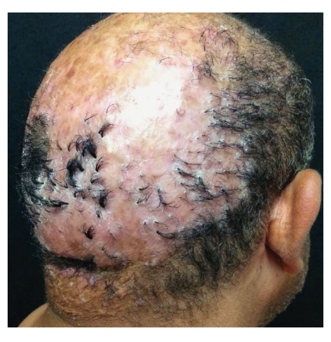
FIGURE 1: Extensive areas of cicatricial alopecia with polytrichia