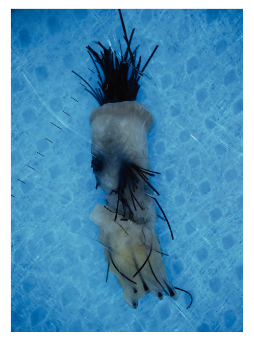
FIGURE 3: Dermatoscopic image of a tuft showing retained hairs within the involved follicular units