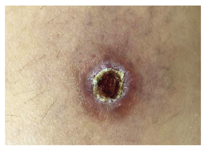
FIGURE 2: Ulcer of approximately 2cm in diameter, red edges with center covered with meliceric crusts