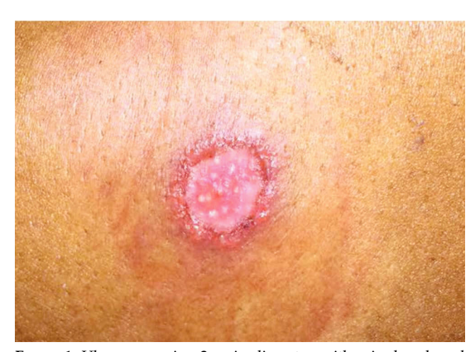
FIGURE 1: Ulcer measuring 2cm in diameter, with raised, red, and irregular edges, with central granulation tissue and serous exudate