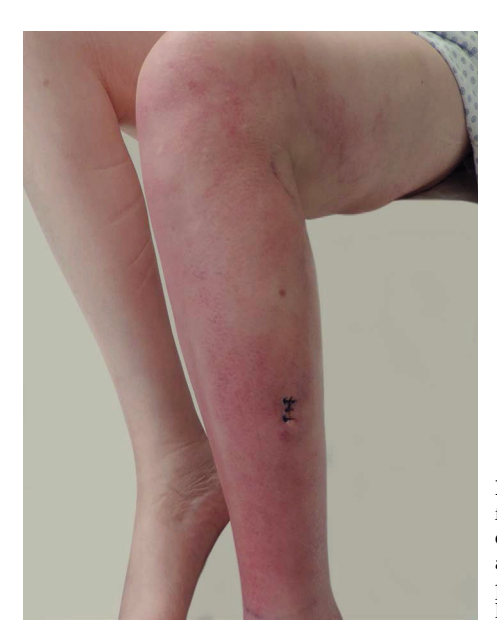
FIGURE 1: Ill-defined, painful, erythematous and edematous plaques on the left thigh and leg