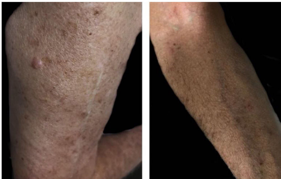
Figure 2 Remission of lesions in right arm (A) and forearm (B).