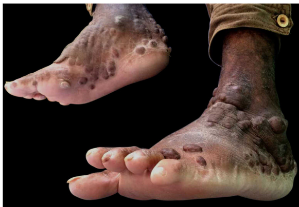
Figure 1 Medial aspect of right foot and lateral aspect of left foot with erythematous-brown plaques.