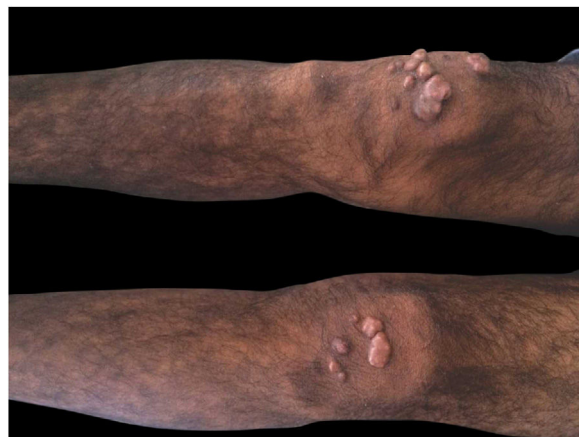
Figure 2 Brownish nodular lesions on the knees.

and hydrolases that induce fibrin deposition and cholesterol crystals in the capillaries and venules, leading to damage. 1,2