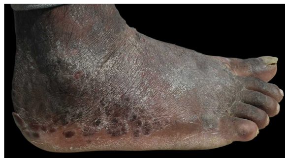
Figure 4 Lateral aspect of right foot after seven months of treatment, showing lesions regression.

presence of fibrotic nodules surrounding the neutrophilic infiltrate (Fig. 3). Clinical and pathological correlation indicated EED. Treatment with dapsone 100 mg/day was initiated, which resolved the lesions within seven months (Fig. 4).