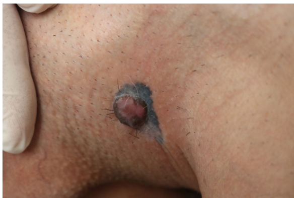
Figure 1 Blue-black colored melanocytic macule with a pinkish tumor on top of it.

blue-black colored macule was discovered on the left side of scrotum, with a 3-cm-diameter, non-tender, well-circumscribed pink nodule on top of it (Fig. 1). His physical examination and routine laboratory investigations were otherwise unremarkable. The authors performed a 4-mm skin biopsy taken from the nodule. Histopathology confirmed the diagnosis of malign melanoma and showed a dermal mass with atypical nested melanocytes, with frequent mitotic figures that were strongly positive for S-100 and melan-A (Fig. 2). Wide local excision with 2-cm surgical margins was performed. The histopathological analysis found pathological stage T4b, 6-mm Breslow depth, Clark level IV, 6 mitosis/mm 2 nodular melanoma with ulceration, without vascular invasion, lymphatic invasion, or microsatellitosis, and the tumor was also positive for the BRAF V600 mutation. In sentinel lymph node biopsy, two-node metastasis was detected without extracapsular extension. Two weeks later, elective dissection of the regional lymph nodes was performed, but the nodes were tumor-free. PET CT scan found no further evidence of metastatic disease. His disease was defined as stage IIIC (T4b, N2a, M0) based on the American Joint Commission