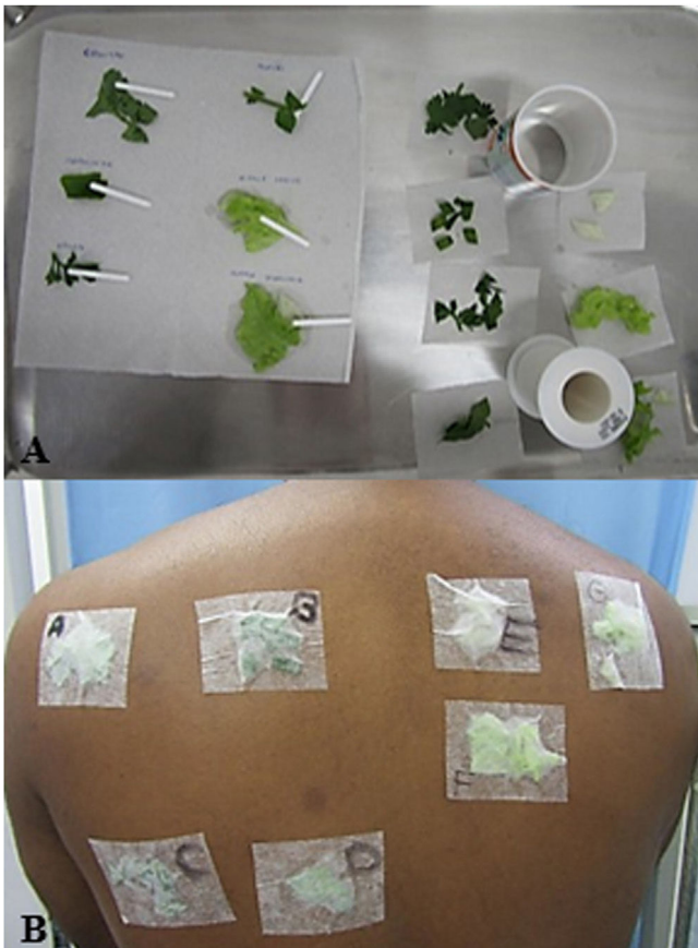
Figure 2 (A) Preparation of leaves with bidistilled water for the prick-by-prick test on the left and contact test on the right. (B) Application of leaves for the contact test identified by letters: (A) Coriander; (B) Chives; (C) Parsley; (D) Watercress; (E) Iceberg lettuce stem; (F) Iceberg lettuce leaf; (G) Leaf and stem of green-leaf lettuce.

effect of the sap, which can cause contact urticaria, leading to false positivity. For research purposes, the authors suggest performing the tests on a control group of patients. 2