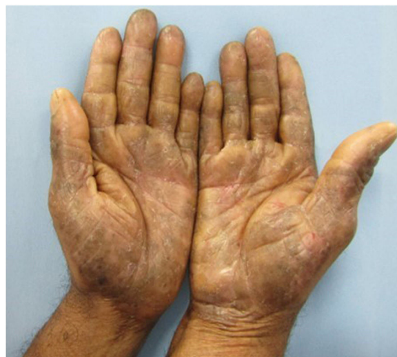
Figure 1 On examination, erythematous, brownish plaques with lichenification, desquamation, erosions and fissures are observed on the hands.

In the case reported herein, the leaves used in the PT were prepared with double distilled water, but ether can also be used. Dilution is necessary to reduce the caustic